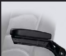
Folding Armrests SW-03963