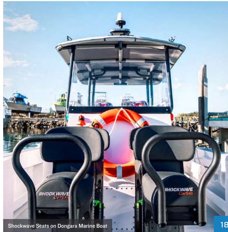
Shockwave Seats on Dongara Marine Boat