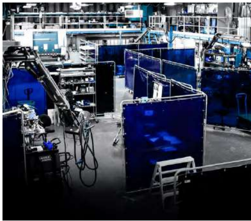
Welding & Fabrication Shop

We manufacture all of our products on-site in our welding and fabrication shop, our powder coating shop (with a huge 24' oven) and assembly shop. Our engineering department is on site and an integral part of everything we build here. We build thousands of suspension bases and suspension seats every year at our plant in Sidney, Canada, and we deliver our products around the globe.