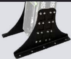
Dual Deck Mount SW-05603