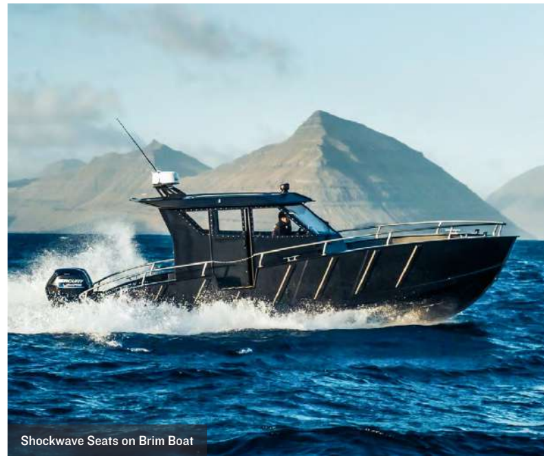
Shockwave Seats on Brim Boat