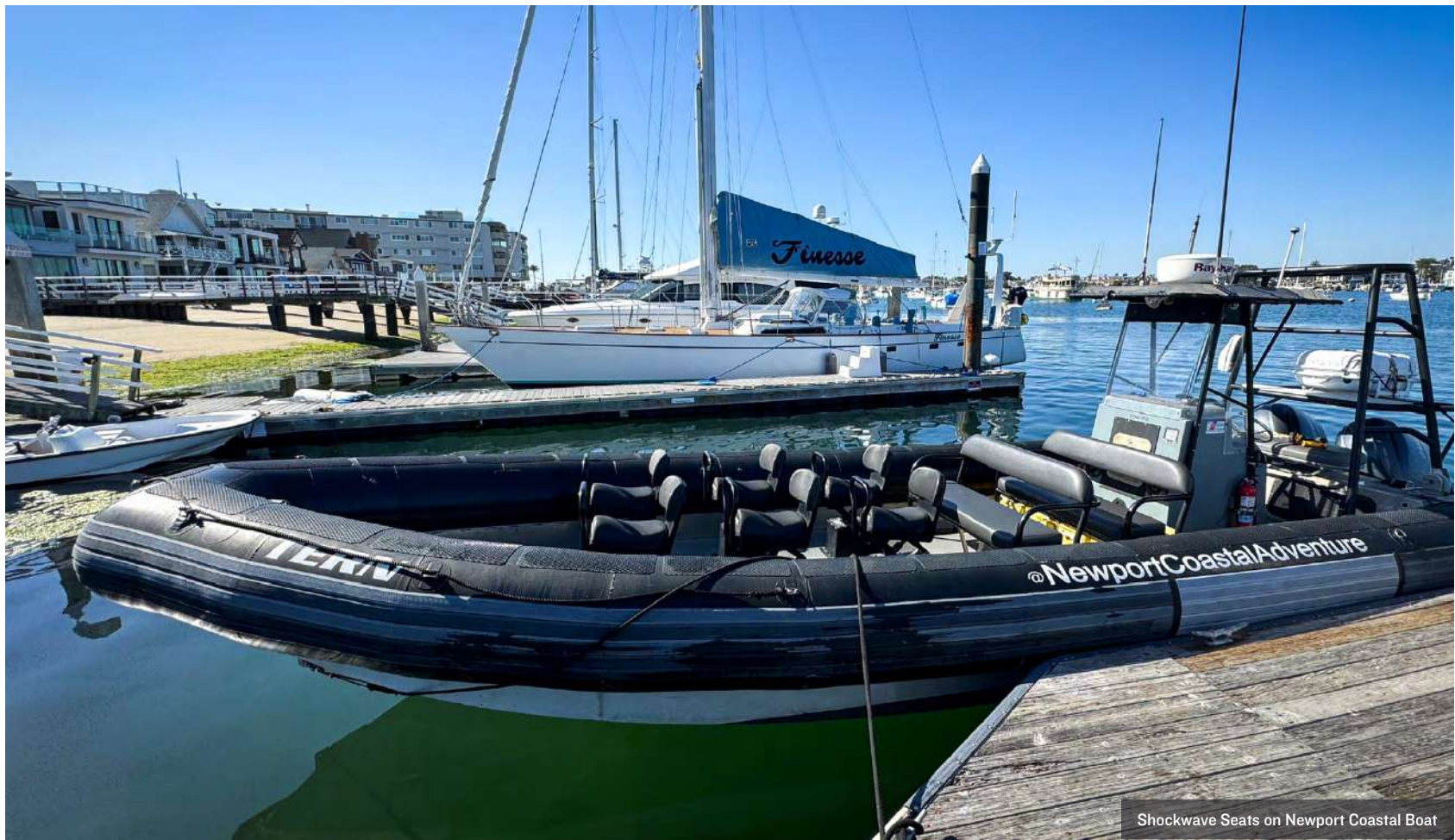
Shockwave Seats on Newport Coastal Boat