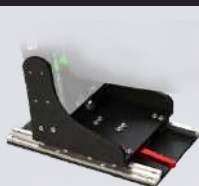
Deck Slide SW-05231