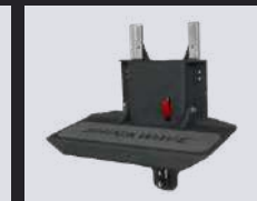
Bulkhead Mount Adjustable Footrest SW-07507