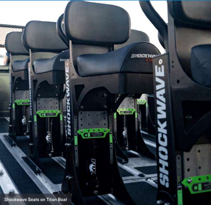
Shockwave Seats on Titan Boat