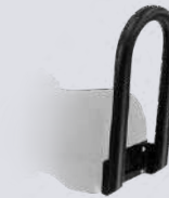
Front Grab Rail Narrow SW-05538