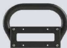
Rear Grab Rail Low SW-05476