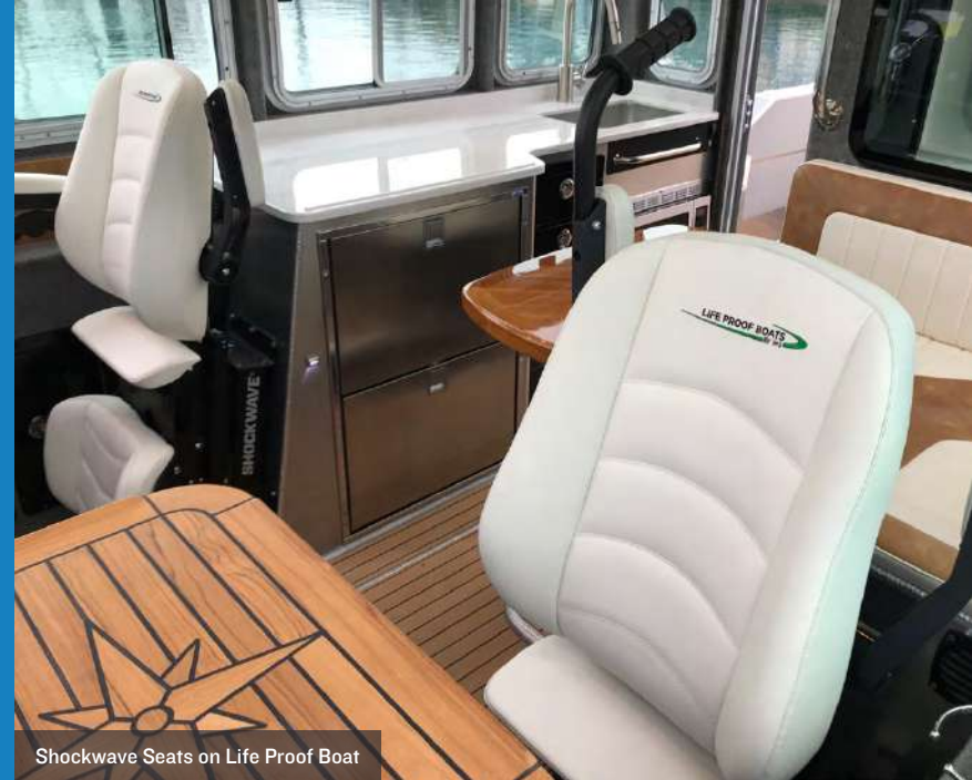
Shockwave Seats on Life Proof Boat