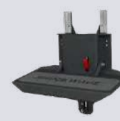
Bulkhead Mount Adjustable Footrest SW-07507