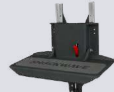
Bulkhead Mount Adjustable Footrest SW-07507