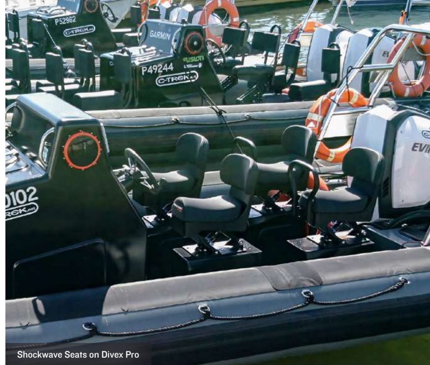
Shockwave Seats on Divex Pro