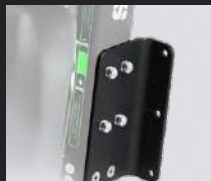
0° Bulkhead Mount SW-04656