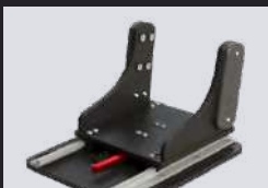
Deck Slide SW-03752