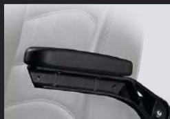
Folding Armrests SW-03963