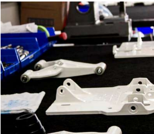
Rec Products Assembly Shop