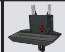
Bulkhead Mount Adjustable Footrest SW-07507