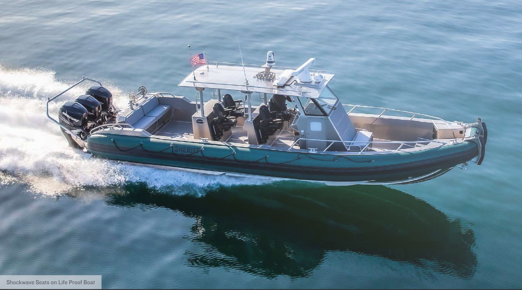
Shockwave Seats on Life Proof Boat