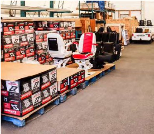
Product Storage & Inventory