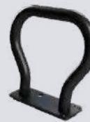
Rear Grab Rail Wide SW-04663