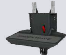
Bulkhead Mount Adjustable Footrest SW-07507