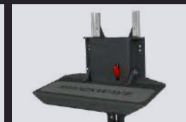
Bulkhead Mount Adjustable Footrest SW-07507