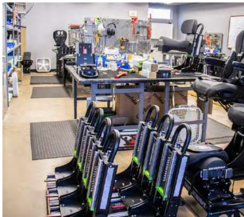
Pro Products Assembly Shop