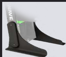
Deck Mount SW-03620