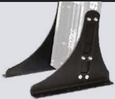
Deck Mount SW-06302