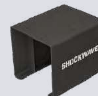
12" Jockey Seat Riser Box SW-09494-B