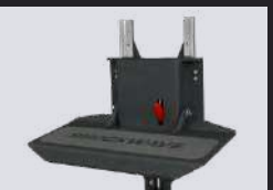
Bulkhead Mount Adjustable Footrest SW-07507