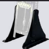
Deck Mount SW-05153