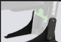
Deck Mount SW-03620