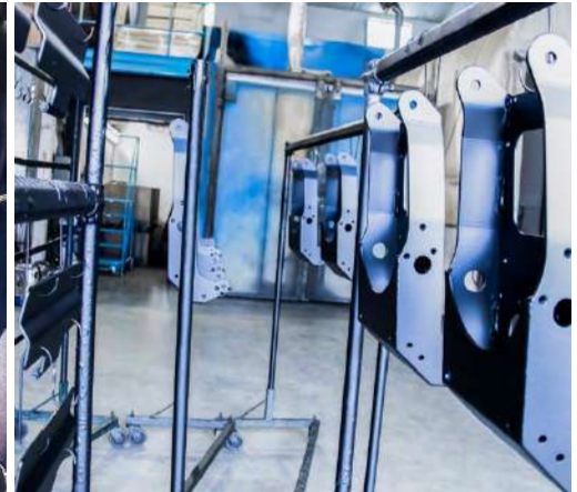
Powder Coating Shop & Ovens