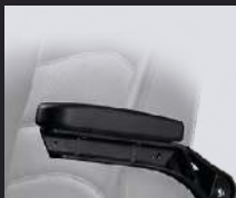
Folding Armrests SW-03963