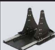
Deck Slide SW-05154