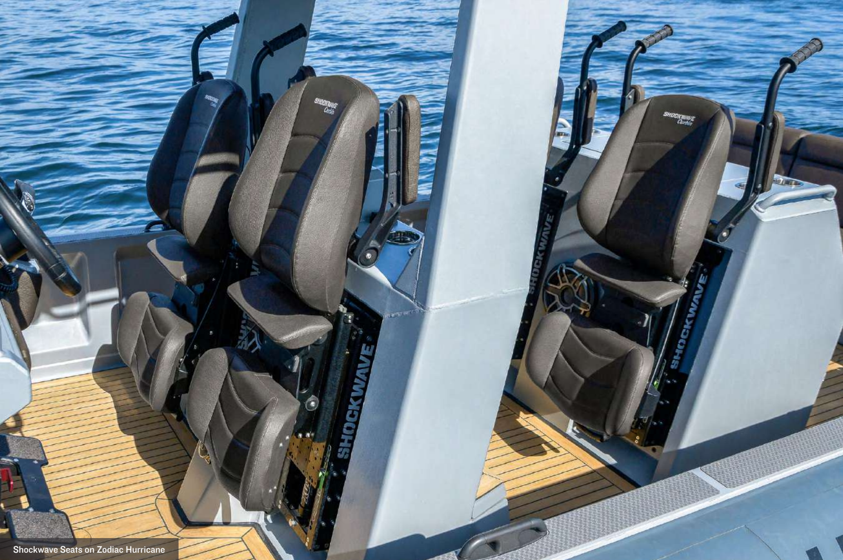
Shockwave Seats on Zodiac Hurricane