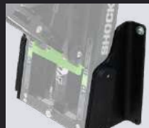
10° Bulkhead Mount SW-04871