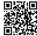
SC311m - EN