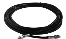
RG-58 MIL coax with pre-assembled FME connectors