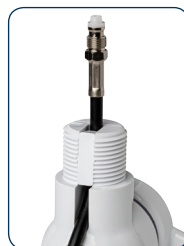
MOUNT with cable slot

QuickFit antennas are extremely versatile and suitable for any type of boat thanks to a large variety of mounting accessories, as well as guaranteeing top-of-the-range reliability thanks to the certified 'Made in Italy' production.