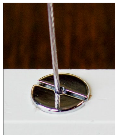
Guide Wire with NEW Flush Mounted Chrome Hold Down