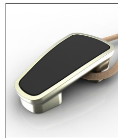
New Oceanair Cord Tidy