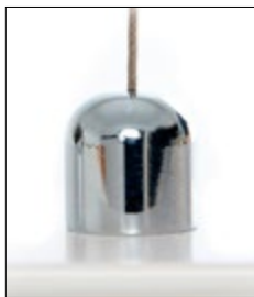
Guide wire with Chrome Dome Hold Down